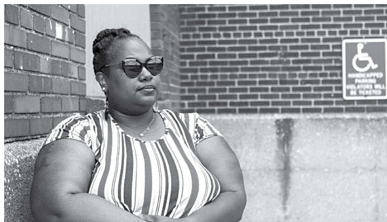
Friends don't let friends drive for rideshare companies, especially unarmed

The bottom line is that WikiHow has chosen their side. Will you support them, or ignore them?