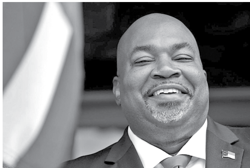
North Carolina Lt. Governor Mark Robinson.

Yes, shooting sports are safe and fun. There's no cause to fear a gun.